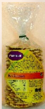
Confezioni da 150g in scatole da 12

Ingredients : whole-meal bio corn, water, salt