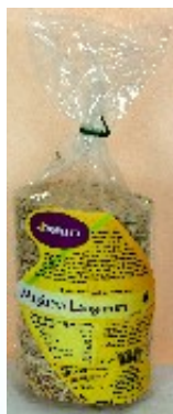
Packages of 120 g in 12 pc. boxes

Ingredients : whole-meal bio spelt of Langa, water