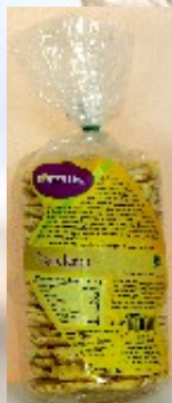
Packages of 150 g in 12 pc. boxes

Ingredients : whole-meal bio corn of Langa, water, salt