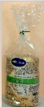
Confezioni da 120g in scatole da 12

Ingredients : whole-meal bio spelt of Langa, IGP Verona rice, water